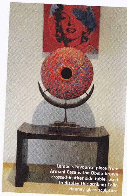
Lambe's favourite piece from Armani Casa is the Obelo brown crossed-leather side table, used to display this striking Colin Heaney glass sculpture

1/F & 2/F, Armani/Chater House, 11 Chater Road, Central, Hong Kong. Tel: 2532 7755