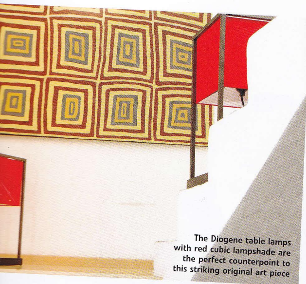
The Diogene table lamps with red cubic lampshade are the perfect counterpoint to this striking original art piece